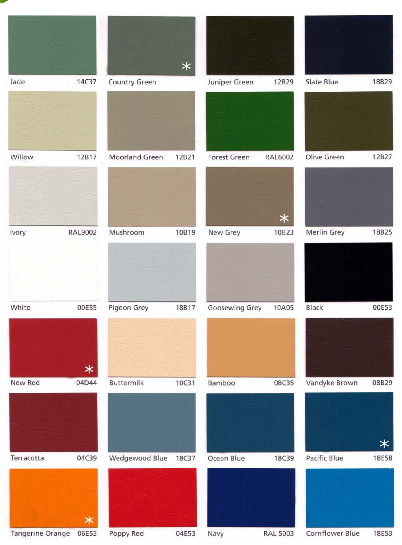
* colour not readily available

Telephone: 01493 658 199 Facsimile: 01493 658 199 Mobile: 07795 437 272 www.cabinsandcontainers.co.uk sales@cabinsandcontainers.co.uk